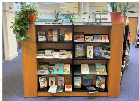
A Knowledge Bank display stand at the Meadows Library.

As the Knowledge Bank grows, you can expect to see it updated with a variety of content, ranging from videos, games, documentaries and more.