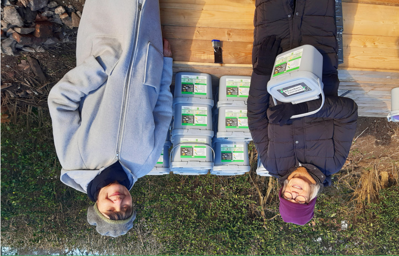
Issue #4 - Spring 2023

Meadows residents collecting their composting caddies.